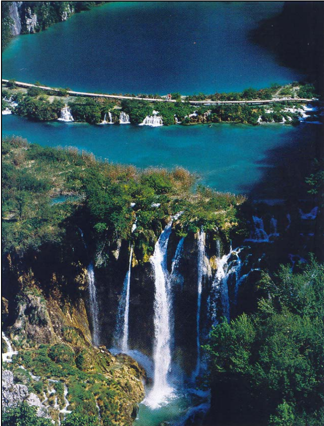
The karst waterfalls of Plitvice Lakes National Park

NEW YORK, N.Y., Nov 1 - "With some 1,200 islands scattered across the Adriatic Sea, Croatia is best seen by boat. And though most visitors will probably choose to avoid a five-week, 400 mile expedition like ours, it's very possible to catch the highlights in a few days," writes National Geographic reporter and expedition member Jon Bowermaster. In its November 2005 Adventure Travel issue, the magazine named Croatia as the first among the top 10 adventure nations for 2006.