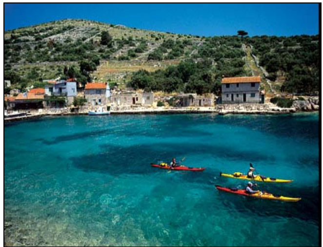
National Geographic Adventure expedition glides past a picture perfect Adriatic island.

"Hallelujah," exclaimed one expedition member as they approached ancient Dubrovnik from the sea, while another noticed its Camelot-of-the-sea resemblance, with its "red tile roofs and winding 80-foot limestone walls giving the impression of a mystical fortress rising out of the waters." Despite its sometimes-turbulent past, the author concludes that Croatia is a survivor. Just like - may we add - the members of this challenging, yet rewarding kayaking expedition on the Croatian coast.