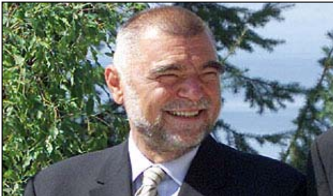
Croatian President Stjepan Mesić received praise, for political and economic moves, from Slovakian President Ivan Gasparovič.

BRATISLAVA, Slovakia, Nov 3 – During his two-day visit to Slovakia Croatian President Stipe Mesić met with his Slovakian counterpart Ivan Gašparovič who praised Croatia as the most developed country in the region, saying also that Croatia is ready to join the European Union and NATO. Gasparovič also stressed the case of the fugitive General Ante Gotovina must not be the reason for discounting accession talks between Croatia and EU, adding that he believed that Croatia has done its best to locate Gotovina. Gasparovič praised Croatia for its economic progress, and added that it could serve as an example to his country in some areas, as in the case of road infrastructure projects. President Mesić said that Slovakia, a country that has integrated with the EU swiftly in terms of economy and culture, served as example to Croatia regarding EU integration. President Mesić said that Croatia would greatly appreciate the assistance of Slovak negotiators in its accession talks.