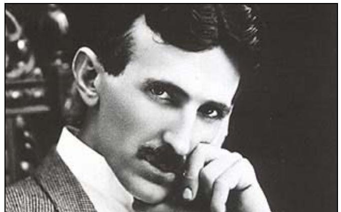
Nikola Tesla

ZAGREB, Croatia, Nov 3 – The Croatian government requested parliament to proclaim 2006 the year of Nikola Tesla, a famous inventor, electrical engineer and scientist who was born in the Croatian village of Smiljan, in 1856. The year of Nikola Tesla, who was trained for an engineering career at the Technical University at Graz and the University of Prague, and who earned his reputation as a scientist while working in the United States will be marked by many events. Croatia is also reconstructing the house in which he was born in the village of Smiljan near the town of Gospić. There are plans to erect a monument in his honor in Zagreb. Tesla died in 1943 in New York. Some of his inventions include the telephone repeater, rotating magnetic field principle, induction motor, alternating-current power transmission, radio and fluorescent lights.