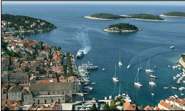
The picturesque town of Hvar lures travelers with its exquisite beaches and lavender-scented breezes. Here, the winds, but not the streets, have names.

The author says that the Adriatic coast of Croatia has once again become a hot travel destination with "a rich diversity of attractions, accessibility and relative affordability as well as its stunning beaches and islands and magnificent food," calling Croatia's present situation a "surprising turnaround" from the war-torn early 1990's and noting that it was named the world's hottest travel destination by Lonely Planet travel guide, while appearing in numerous other magazines. The author recognizes that many foreign investors "see gold" in Croatia's tourist industry, and new or renovated hotels owned by Western firms stand as elegant monuments to the potential of the tourist industry here.