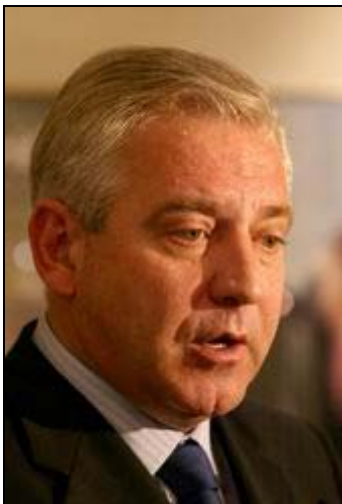
Prime Minister Sanader on linking Croatia's North and South.

Prime Minister Ivo Sanader formally opened construction work on what will be the longest bridge in Croatia, connecting the southernmost Dubrovnik region with the rest of the country. (Page 2)