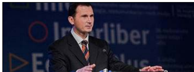
Minister of Science, Education and Sport Dragan Primorac speaks at the opening ceremony.

ZAGREB, Croatia, Nov 8 – Three international specialized trade fairs INTERLIBER [Books and Teaching Appliances Fair], EDUCA Plus [Exhibition of Lifelong Learning and Human Resources Development] and INFO [Information Technology] are taking place in Zagreb. Croatia has chosen the path of knowledge, setting 2010 as the year by which it wants to become the most competitive country in the region in terms of knowledge, the Minister of Science, Education and Sport Dragan Primorac said at a ceremony opening the three trade fairs. Primorac said that one of the government's goals was to ensure that by 2007 every primary school child would be computer literate and with the knowledge of two foreign languages. He noted that investment in science had increased, adding that his ministry received 15 percent of funds from the national budget.