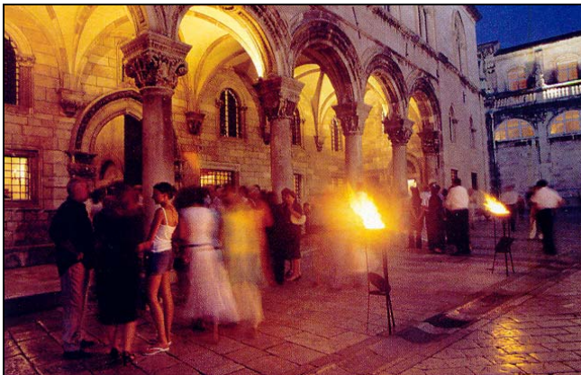
Concertgoers gather at the 15 th century Rector's Palace where open-air performances are held in the atrium. With its romantic setting, it's the top venue in Dubrovnik.

NEW YORK, N.Y., Nov 1 - The craggy beauty of Croatia's coastline and tourism industry have in the past year been featured countless times in magazines and newspapers worldwide, and perhaps no other small city in Croatia - or the world, for that matter - has acquired a reputation that eclipses its own actual size, to the extent that this remarkable town has. We are referring to Dubrovnik, naturally, and so is