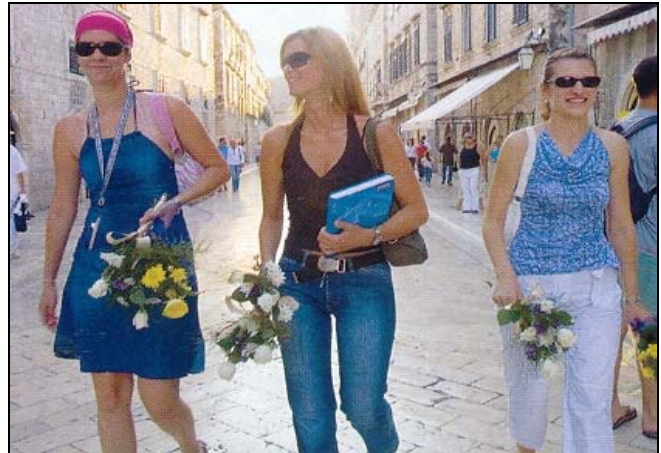
Friends walk along the white limestone Placa.