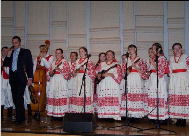
CroatiaFest, part of Seattle Center’s year-long series of international cultural events