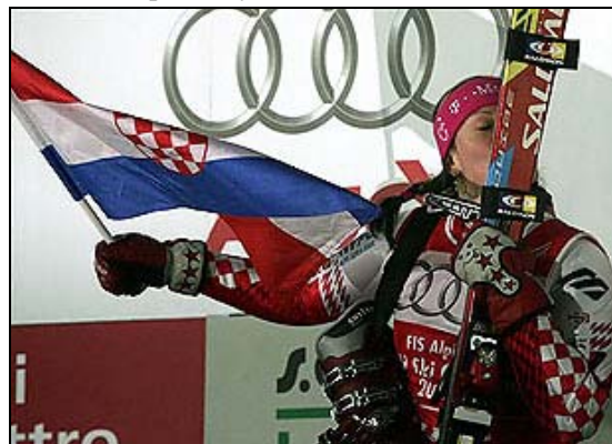
Croatian skier Janica Kostelić does not cease to impress with her performances.