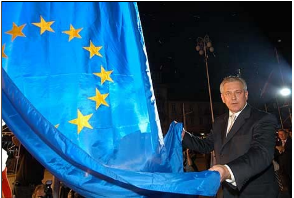
The opening of EU accession negotiations was the main achievement of the Government of Prime Minister Ivo Sanader in 2005. Above, Prime Minister Sanader, pictured in June 2004, on the occasion of Croatia becoming a candidate for entrance into the EU. (Page 3)