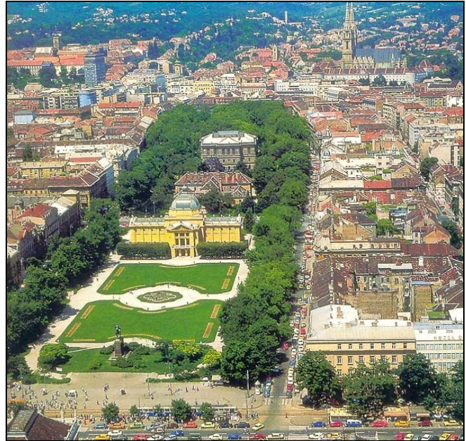
Croatia's central European capital city, Zagreb, is discovered by more and more U.S. tourists each year, thanks to its wide variety of attractions, events and a truly unique atmosphere.

WASHINGTON, D.C., Dec. 29 - Croatia will be the top new foreign destination for U.S. tourists in 2006, according to the U.S. Tour Operators' Agency (USTOA). And Lonely Planet, the world's largest travel guide, appears to think the same. USTOA, whose assessment was reported by CNN and AOL, organizes trips for more than 10.5 million U.S. travelers each year. It has placed Croatia in front of China, the second most popular new destination for Americans next year, in the rankings. Lonely Planet, whose staffers have once again ranked Croatia among the top five tourist destinations for 2006, says that the country is particularly attractive to U.S. tourists because of its spectacular coastline and islands, its cultural, historical and gastronomic offerings and since it has a reliable tourist infrastructure, free of crowding that is often present in other Mediterranean countries. In 2005, 125,000 U.S. tourists visited Croatia, a 39% increase from 2004. Croatia's tourist industry has received much attention in the U.S. media in the past year, with coverage in National Geographic, Washington Post, New York Times, Budget Travel Magazine, NBC, E!, and other print and electronic media outlets.