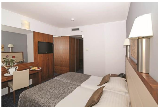
Hotel Lero typical room