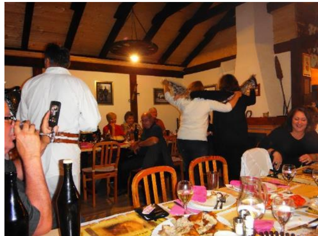
Party time at Villa Rubcic near Plitvice lakes