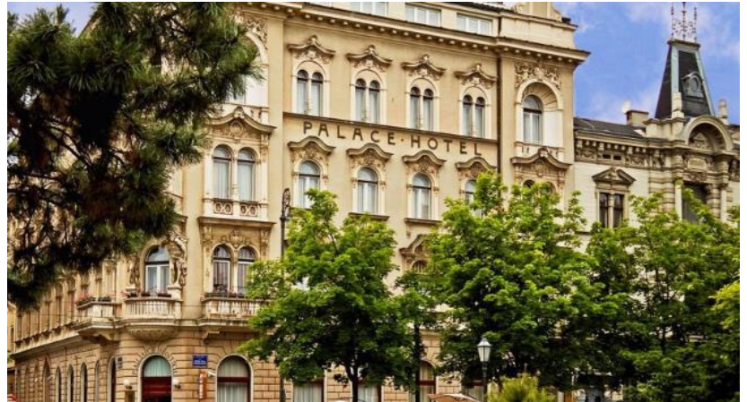
Scenes from Zagreb

DAY 11, 19 May, 2019 Sunday ZAGREB – BUKOVLJE