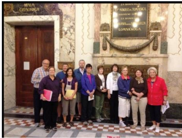
At the National Archives

Visit of the archive in the morning, free afternoon for meeting friends and relatives. Open day!