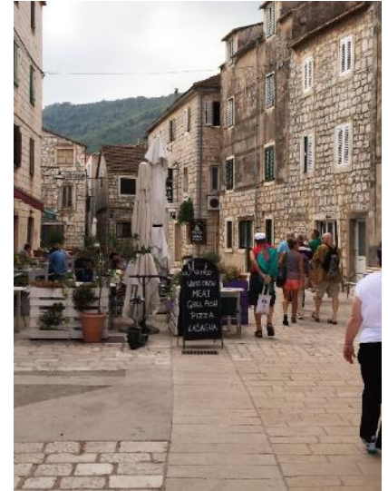
A ferry will take us to Straigrad Hvar, a town which dates back 4.,000 years

DAY 6, 14 May, 2019 Tuesday SPLIT – RAKOVICA i.e. Plitvice 270 km