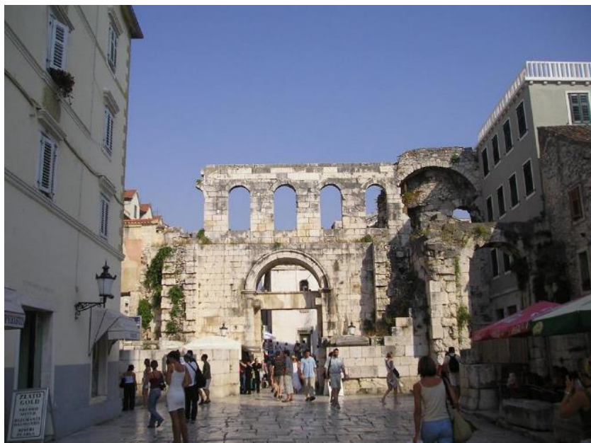
Scenes from the old Roman Emperor's Palace at Split

DAY 7, 15 May, 2019 Wednesday - PLITVICE