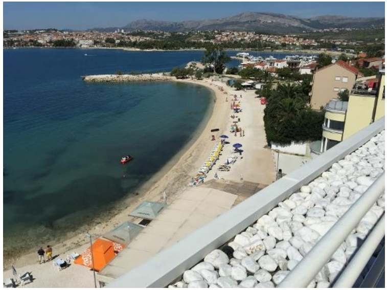
Above left is the village of Ston, left our seaside hotel near Split