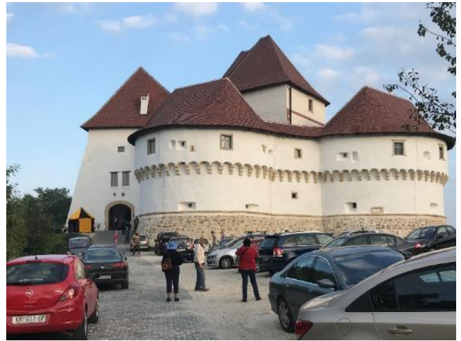
Zagorje the land of castles, with the largest concentration of castle in Europe

DAY 14, 22 May, 2019 Wednesday ZAGREB AIRPORT