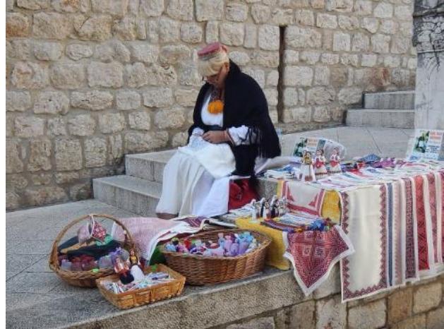
The famous walled city of Dubrovnik