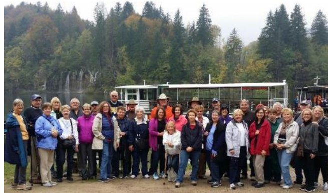
Plitvice Lakes Park

DAY 8, 16 May 2019, Thursday PLITVICE - ĐAKOVO – OSIJEK 420 km