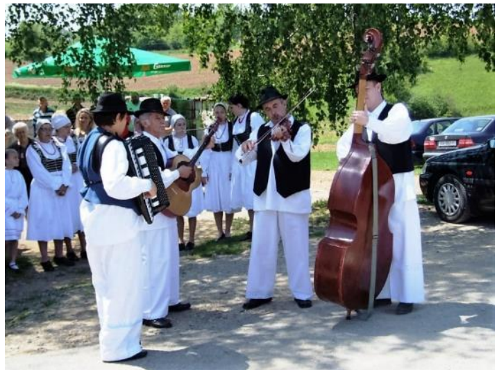
Visiting the a small Croatian village, Gornje Bukovlje, much as it was in our ancestor's day