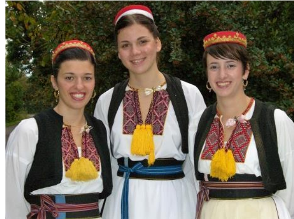
Scenes from Cavtat

DAY 4, 12 May, 2019 Sunday CAVTAT - SPLIT (250 KM)