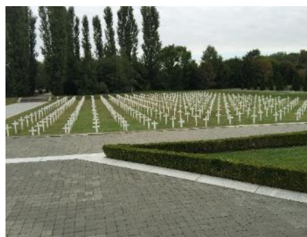
Above scenes from Vukovar